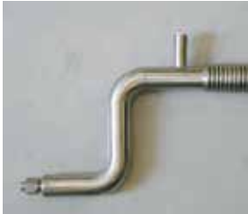
"S" Curve Line